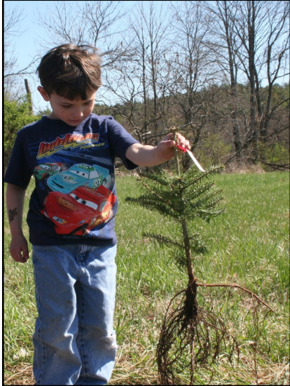
(Specimens are bare root seedlings)